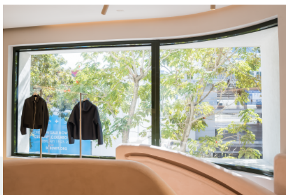
Boutique Upper-level - Curved Window