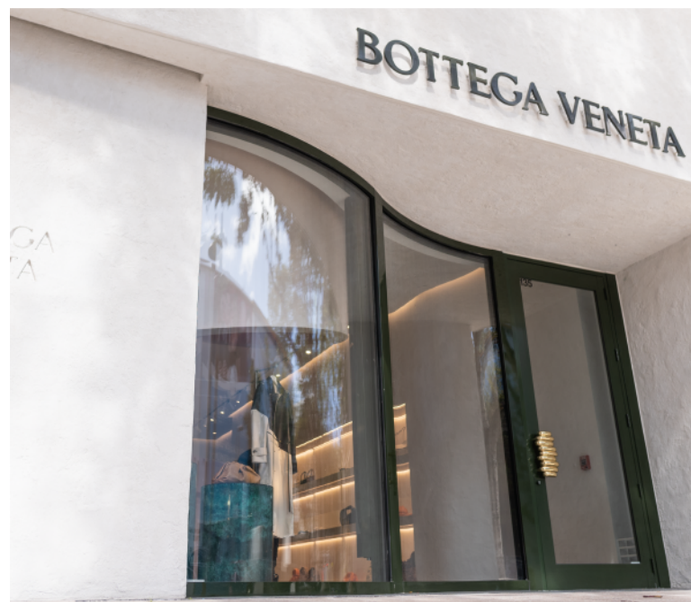
Boutique Entrance - Aluminum Curved Oversized Flood Window Door supplied by Aldora